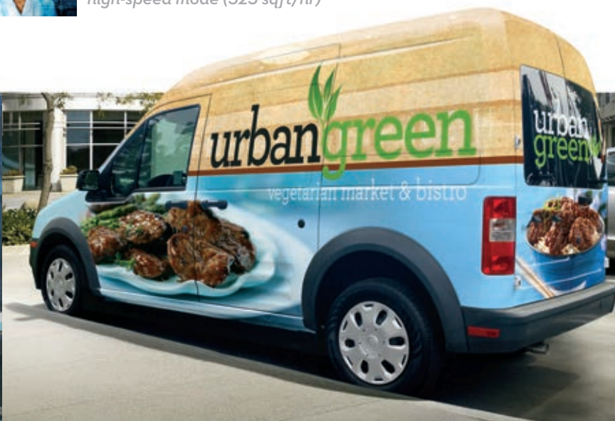
High Speed Printing Without Sacrificing Quality Ideal for impactful high-volume applications such as fleet vehicle graphics