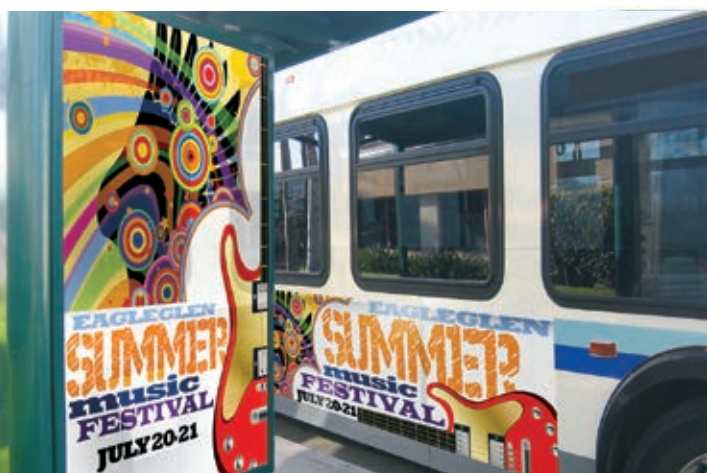
PANTONE ® Spot Color Libraries Direct support for best color matching on your profiled media

[12' x 2.5'] Partial Bus Wraps high-speed mode (323 sqft/hr)