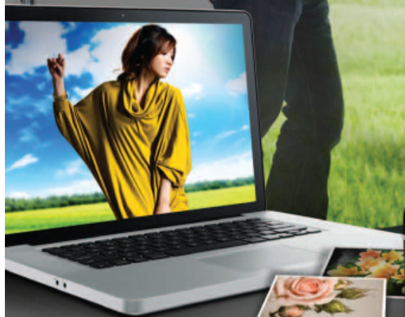
Photo Inkjet Epson L800

True photo quality printing is truly affordable with the world's first Original Ink Tank System